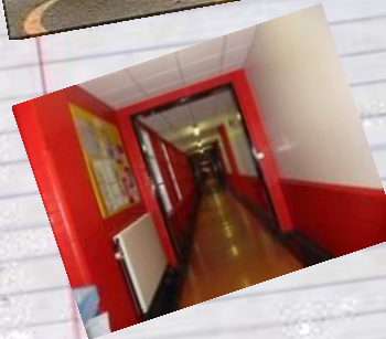
Being pushed or pulled around