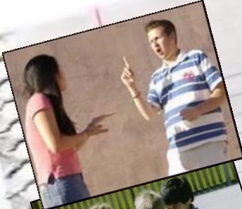
Being called names