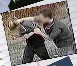
Being hit or attacked