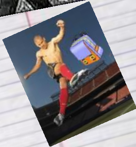
Having your possessions taken and thrown