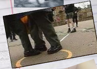
Racist or sexist attacks