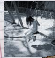
Being ignored and left out